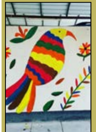
WALLS THAT SPEAK New art project SEE PAGE 2