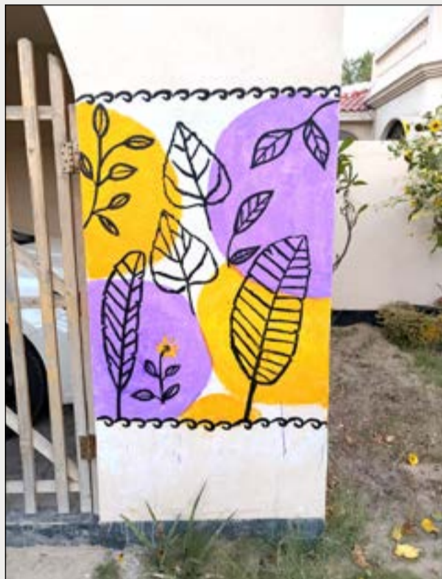
VIBRANT: Another artwork done as part of the Tear down the wall project