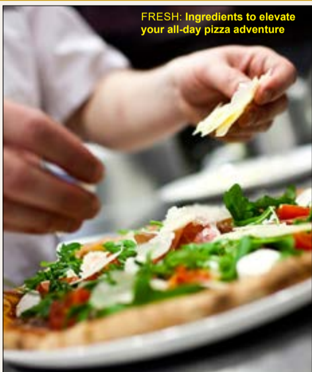
FRESH: Ingredients to elevate your all-day pizza adventure

Every Friday in May, Bahrain Bay Kitchen celebrates the vibrant flavours of Latin America. Guests can indulge in a lively feast of ceviche, quesadillas, tacos and nachos, complemented by live music.