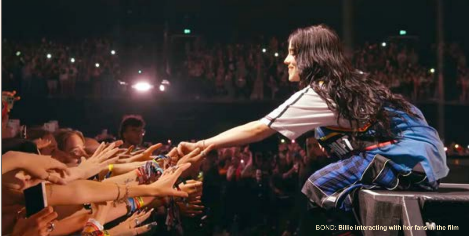
BOND: Billie interacting with her fans in the film

G RAMMY-WINNING singer Billie Eilish's concert film Hit Me Hard and Soft: The Tour Live in 3D is now in theatres.