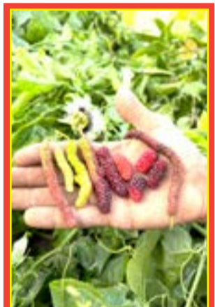
FRUITS OF LABOUR Cooking with mulberries SEE PAGE 3