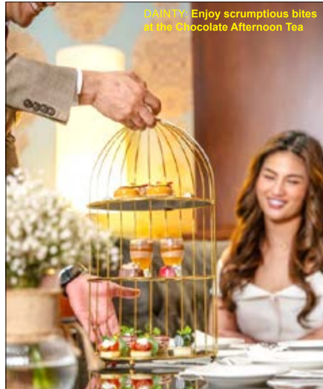
DAINTY: Enjoy scrumptious bites at the Chocolate Afternoon Tea

Featuring an indulgent Mexican set menu served family-style, the experience celebrates authentic