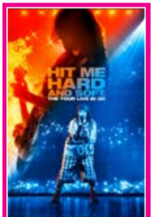
PULSE OF POP Movies, books & more SEE PAGE 6

COMMUNITY REPORT By MELISSA NAZARETH melissa@gdnmedia.bh