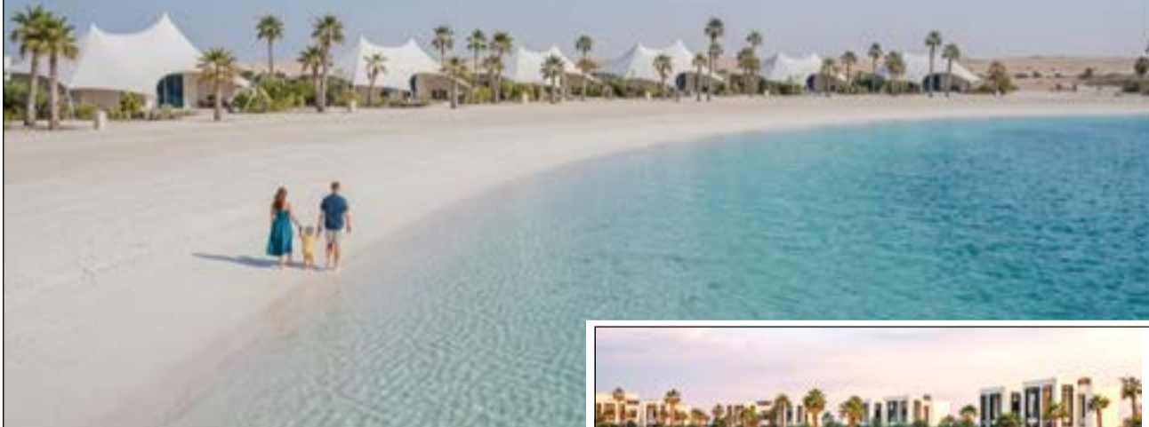
STUNNING: A gorgeous island escape

E NJOY a midweek escape with an exclusive three-night stay at Hawar Resort By Mantis, which offers the perfect opportunity to unwind, reconnect with nature and explore a range of island activities at your own pace.