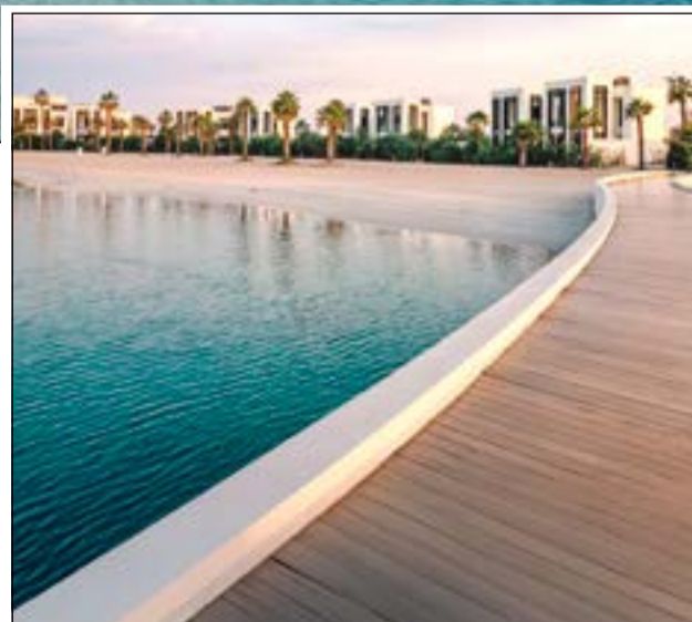
HAVEN: The luxurious villas at the resort

For more information or bookings, call or WhatsApp 32183610, or email reservations@hawarresort.com .