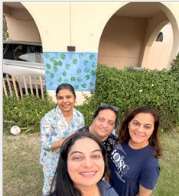
CREATIVE: The artist with her friends