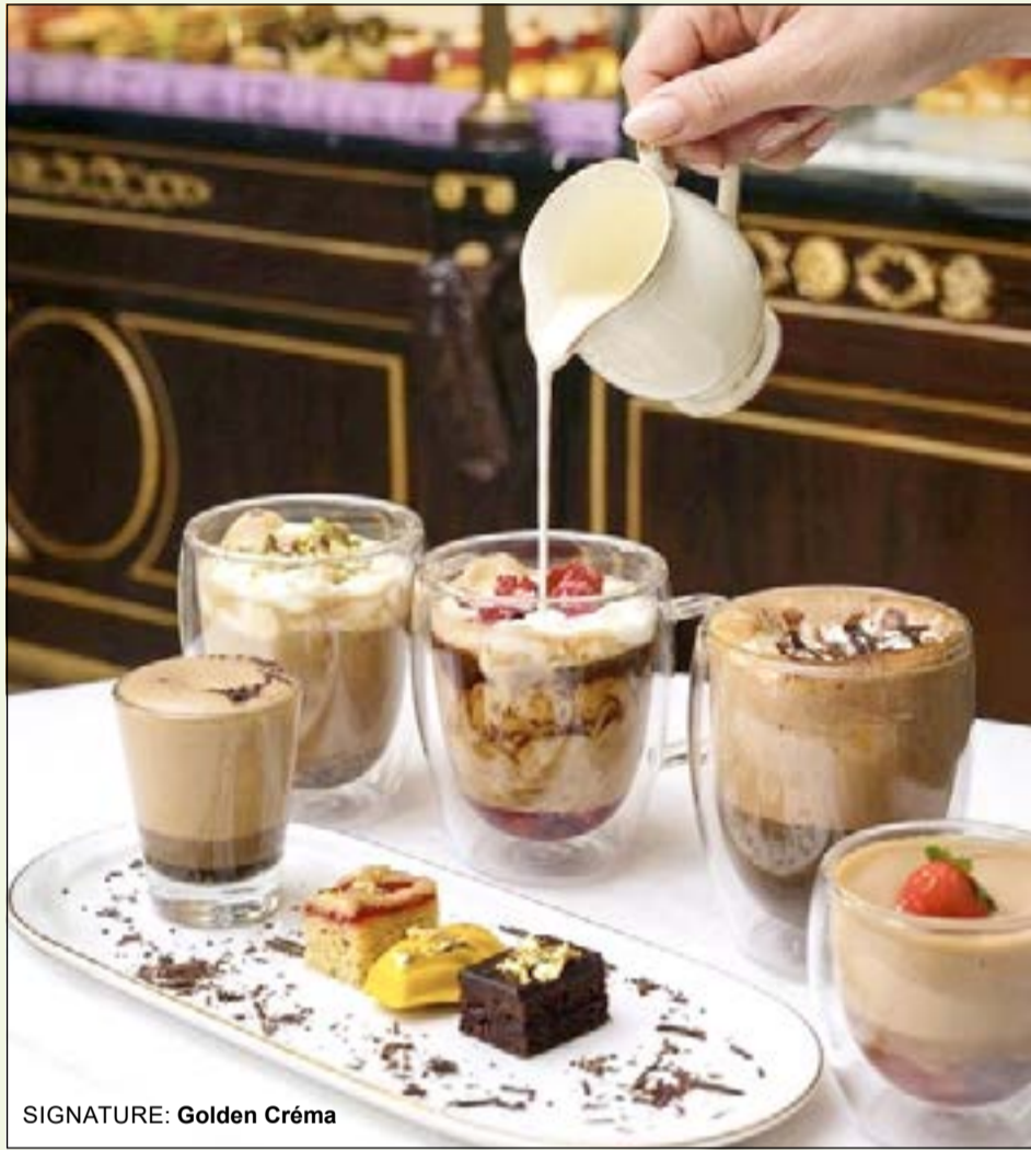
SIGNATURE: Golden Créma